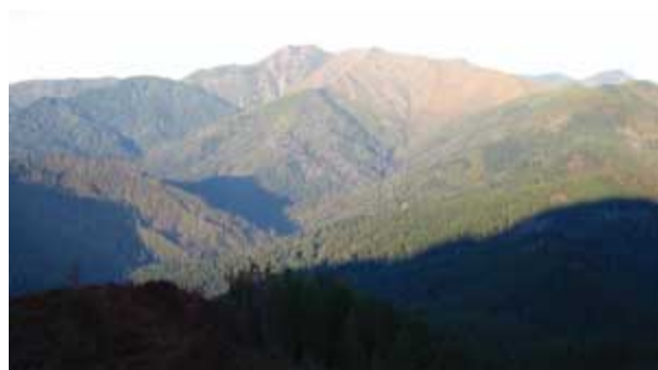
pre-fire, aerial view, Kalmiopsis Wilderness Area

Given that fire is a part of natural ecosystem processes in western forests, however, what is the benefit in helping reforestation along? Won't the forests just grow back naturally if they are left alone? According to Sessions, researchers are increasingly recognizing that climate conditions are not static and future landscapes may not replace the older conifer forests with what existed pre-fire. That's because conditions in the area have changed since the time the older forests originated.